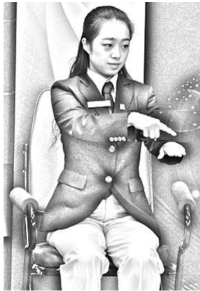
Figure 5 Inside the end line

6. If the ball does not project near vertically upwards, umpire or assistant umpire shall do: