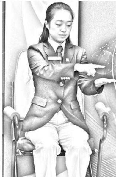
Figure 1 Not high enough

2. If service does not start with the ball resting freely on the open palm of server's stationary free hand, umpire or assistant umpire shall do: