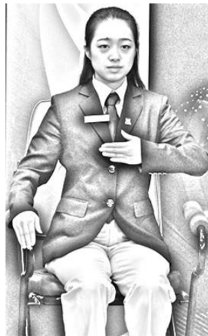
Figure 7 Hidden by what or whom

If the player asks the reason why or where, the umpire will use his or her index finger to show it. For example: If the ball is hidden from the receiver by the server's shoulder, the umpire's action is as follows: