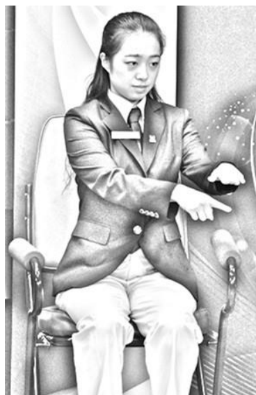
Figure 4 Below the playing surface