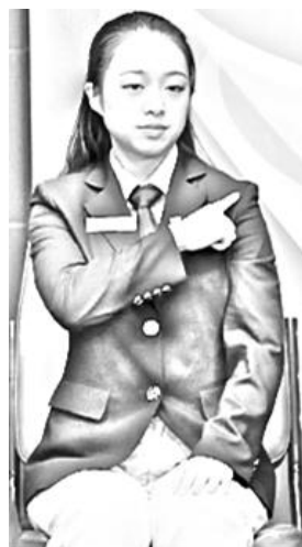
Figure 7(1) Verbal communication: Hidden by shoulder