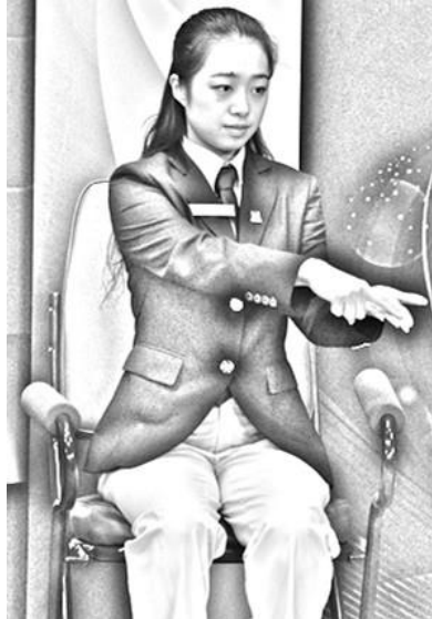
Figure 3 Ball resting on the fingers

4. If the ball is under the level of the playing surface from the start of service until it is struck, umpire or assistant umpire shall do: